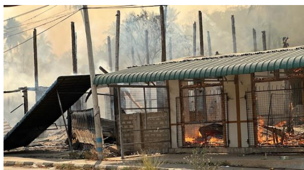
Destruction from SAC airstrikes in Pasaung town

On March 4, SAC LIB 531 fired artillery shells at villagers returning in three tractors from an IDP camp to check on their homes in Pruso township, but fortunately no one was hurt.