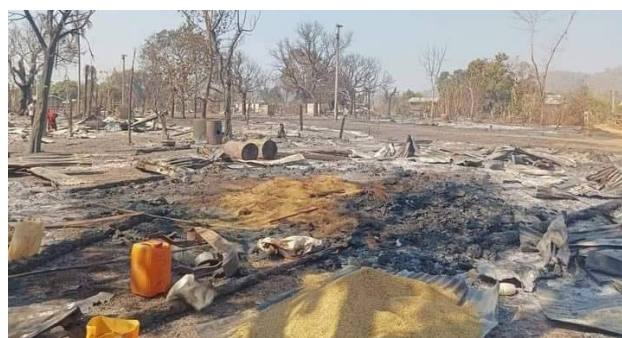
Civilian houses burned down by forest fire, Loikaw township

On March 6, a 48-year-old man stepped on a SAC landmine while he was returning home from his farm in Moebye township, injuring his left hand and leg.