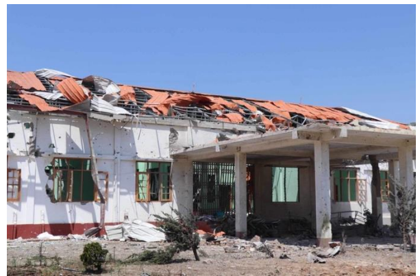
Damage from SAC bombing of Sai Kon village, Phekon township

On April 1, despite there being no clashes in Moebye township, the SAC dropped two 500-pound bombs on Moebye town, damaging five houses. On the same day, two dead bodies were found in Daw Paw Kleh village, Loikaw township. The bodies, whose hands were tied with rope, have not yet been unidentified.