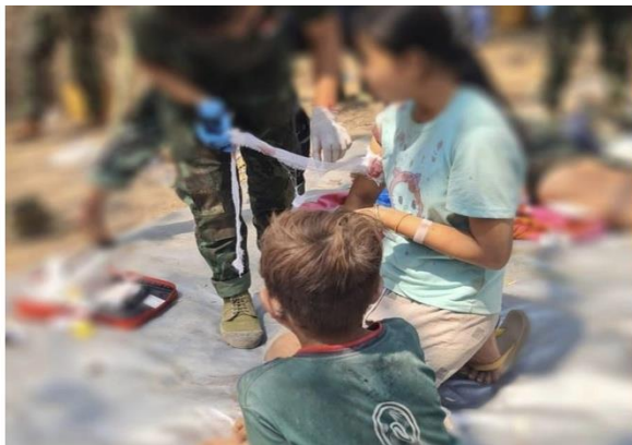
SAC aerial bombs injured 3 civilians, Pasaung township

On March 20, despite there being no clashes in Pekhon township, SAC aircraft dropped four 500-pound bombs on La Ei village hospital, killing a 17-year-old boy and a 47-year-old man, and injuring four other civilians. The hospital was also damaged by the airstrikes. On the same day, SAC troops from the Htoo Chaung outpost in Bawlake patrolled into Pasaung township and were ambushed by the Karenni combined forces near Pan Pu village, leading to 14 SAC troops being killed and 18 injured.