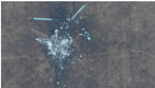
A SAC helicopter shot down by Karenni combined forces, Bawlake township

On May 13, at 10 am, the Karenni combined forces launched an attack on a guard outpost set up by the SAC IB 135 in Pasaung town, and seized some ammunition. On the same day, at 11 am, a 30-year-old woman stepped on a SAC landmine while cleaning her home compound in Loikaw town, and lost her right leg.