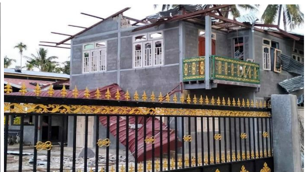
House damaged by SAC artillery shells in Lay Pho Gyi village, Loikaw township

On May 14, about 60-100 soldiers from SAC IB 261 based in Nwa La Boe, Loikaw township, were sent into operation between Htay Plow Khu and Lay Pho Lay villages, causing the Karenni combined forces to issue a warning to local civilians.